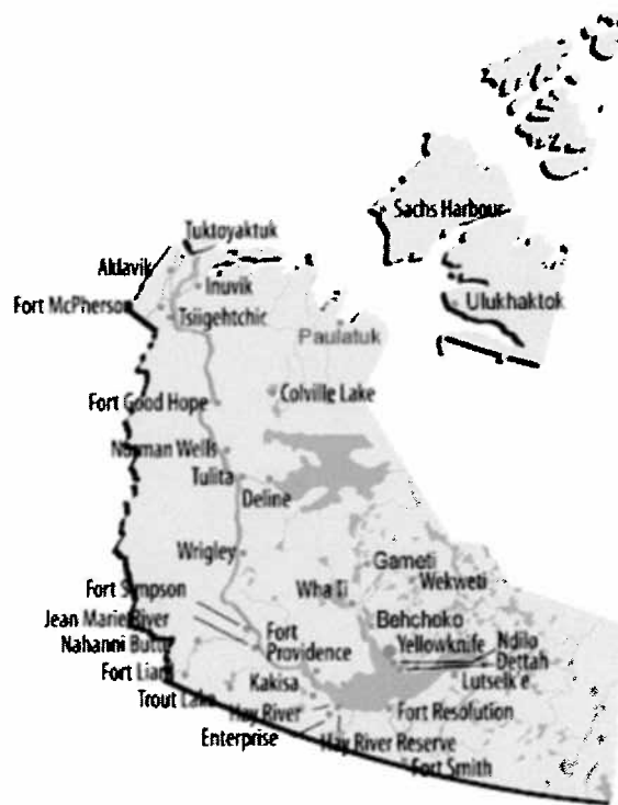
Figure 1 – NTPC Operating Area

The insert map illustrates the operating area of the Corporation, a land area that rivals the largest province in Canada. The detailed map highlights the isolation of many of the communities that we serve – some accessible only by air, barge or winter road. The population is divided among the communities, 25 of which have a population less than 1,000 and only 6 of the 31 communities have more than 1,000 persons, none greater than 20,000. Total electrical load is approximately 68 MW with isolated power systems having generating capacities ranging from 65 MW at Snare/Yellowknife to 240 kW at Colville Lake and with the exception of the two small hydro grids these systems are isolated and unconnected, each must be planned for and operated independently.